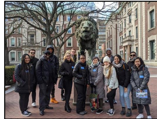
Columbia University, March 2020