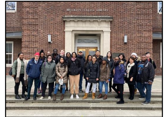
Brooklyn College, March 2020