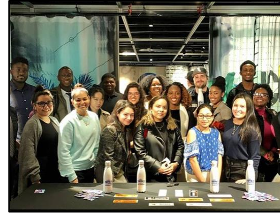
Nike House of Innovation October 2019